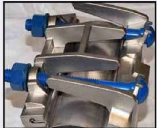
Integrated Handle for Ease of Installation